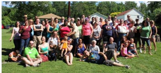
Picnic goers posing for the annual pic, used as the banner for the exJW Recovery Group on Facebook.